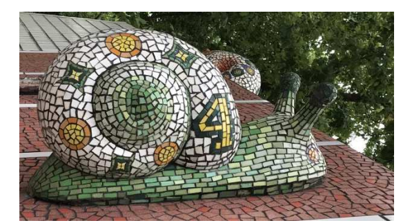
Mosaic Snail—public art work in Taipei.