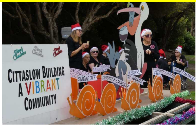
Working together, finding solutions!