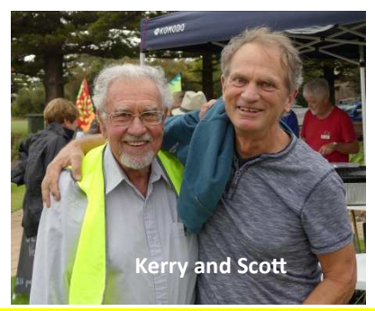
Happy Snaps taken at the Wharf on 26 January, 2019 by Rod Flintoff.